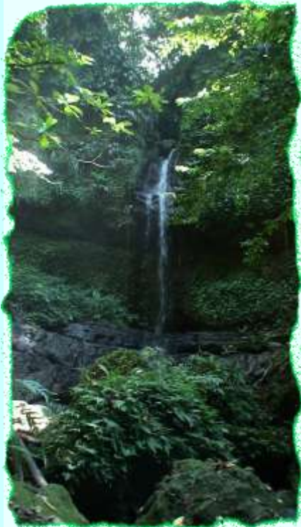
Martinique, montagne Pelée, Grand'Rivière. Mai 2010